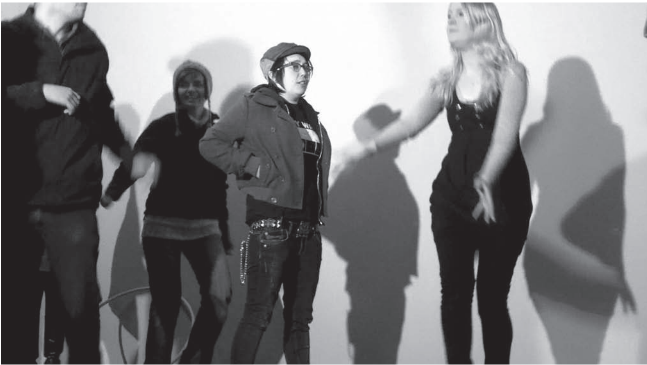
Still from Not Squares Video filmed in ADHOC.