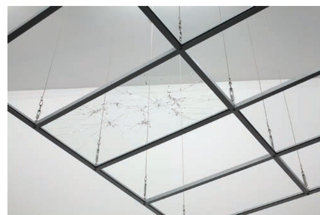
Pat Foster &amp; Jen Berean 'The Doing and Undoing of it All', detail, 2009