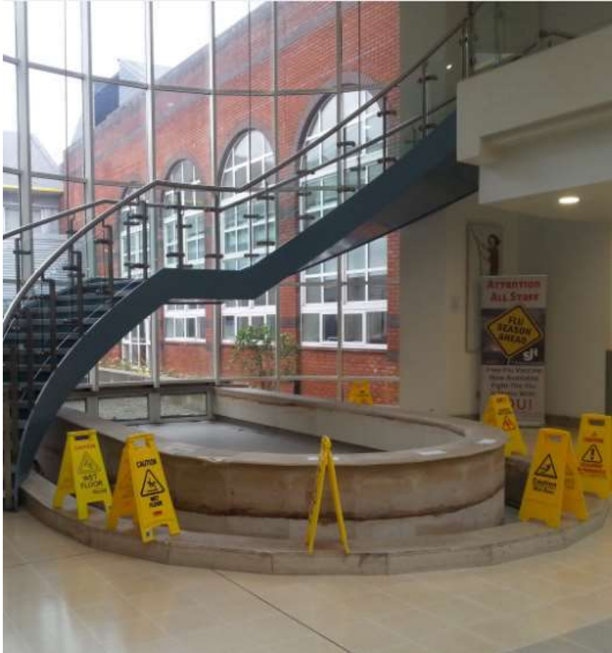
Figure 2 Site Location Photo

Main Concourse area beside the staircase of St. James’s Hospital, Dublin.