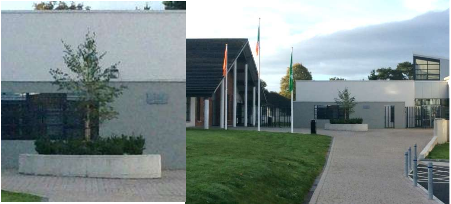
A: ROUNDAL : SCHOOL ENTRANCE