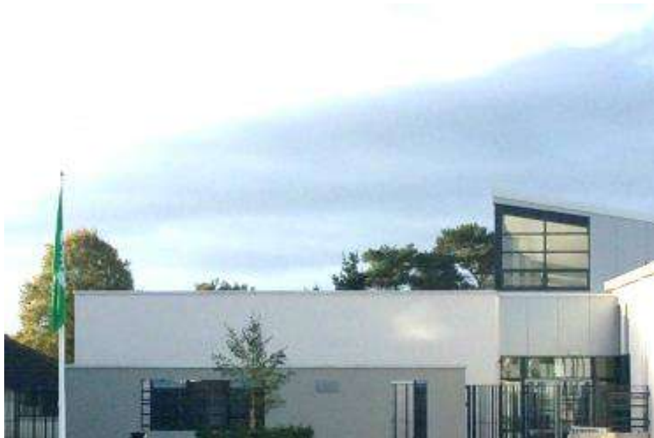
B: PASSAGE WALL