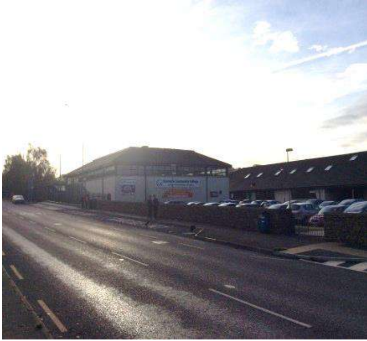
C: SCHOOL ENTRANCE