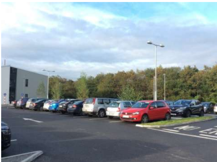
E: CAR PARK