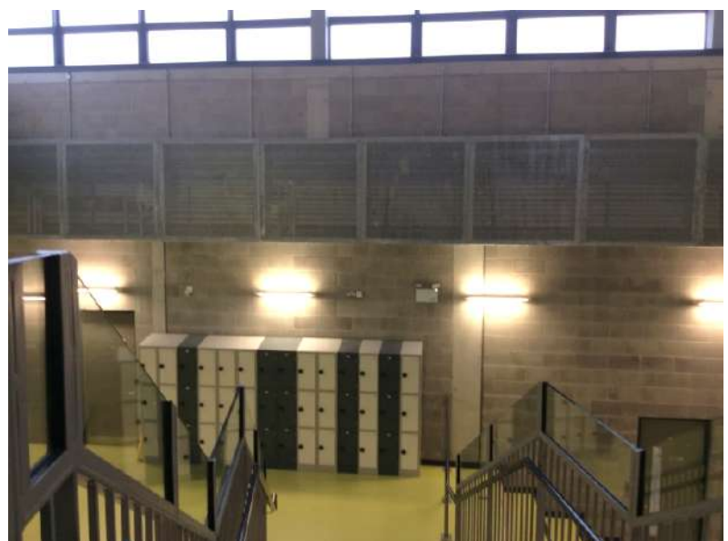
C: WALL 2