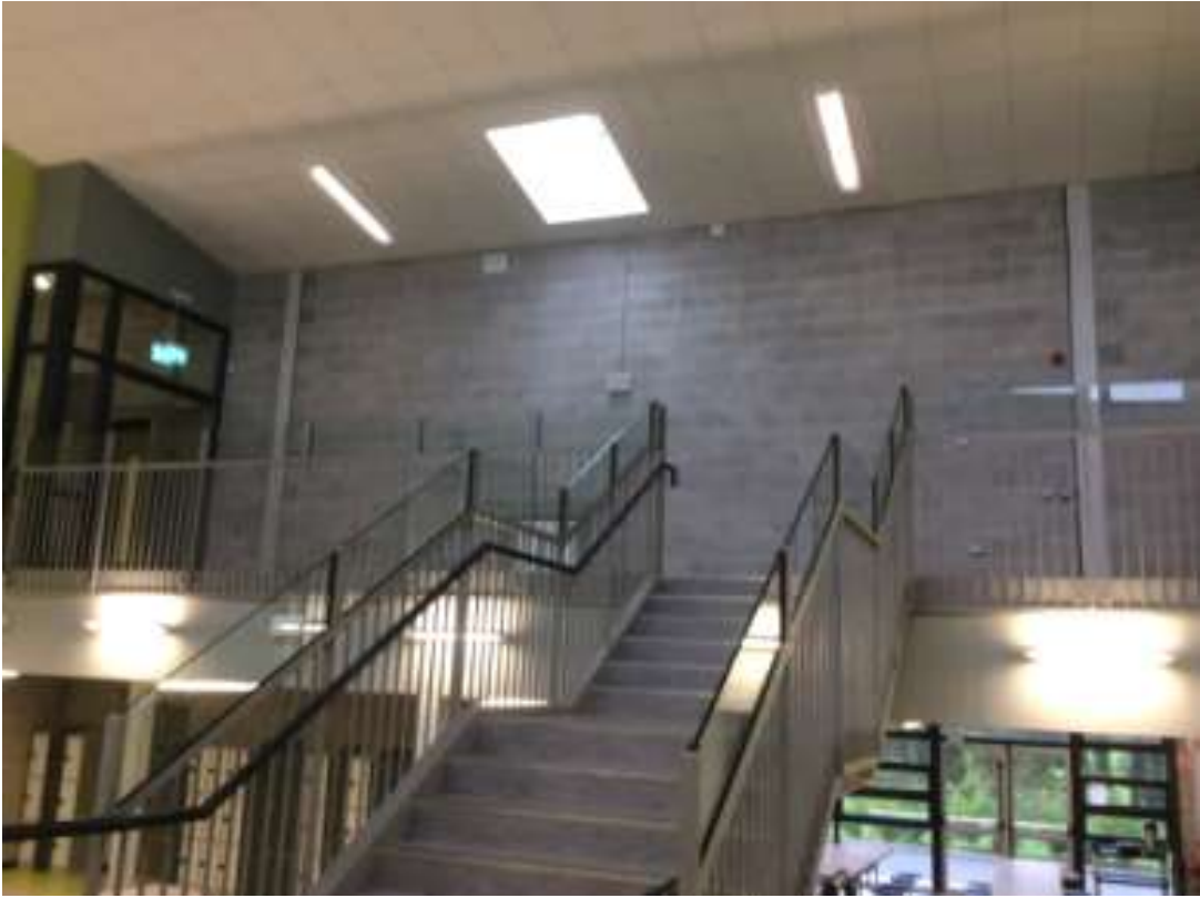
D: FIRST FLOOR WALL